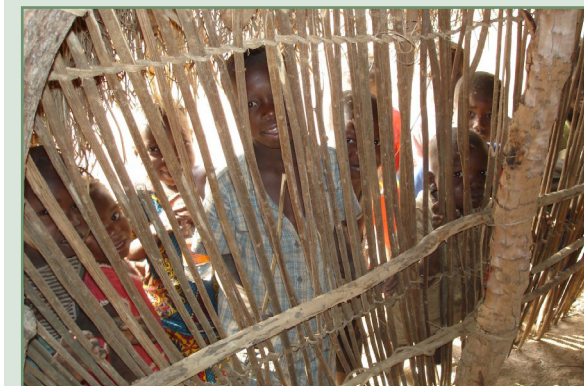
Children looking through the village school wall

Local pastors will be able to reach the scattered congregations they serve by riding a motorcycle, instead of walking. The motorcycles will also be used to transport people for health care.