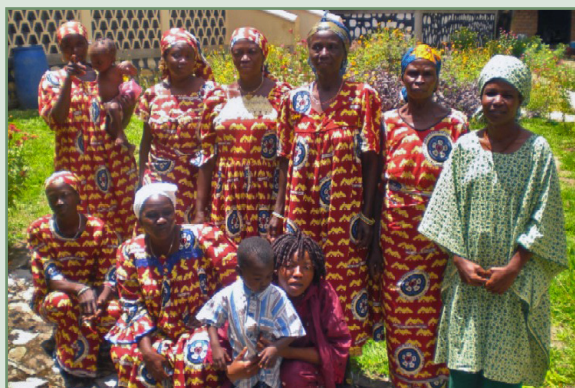
Standing in the Women's Center courtyard wearing clothing bearing the Luther Rose as seen on the cover of this pamphlet

With one doctor for every 38,000 people, the need for local clinics is huge. This new Lutheran clinic hopes to reduce infant and maternal mortality, teach nutrition and AIDS education, and more.