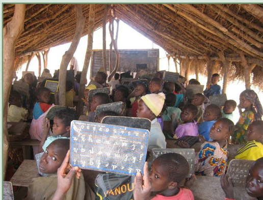
Children in class at the village school

Ten percent (10%) of our Global Gifts will help support ELCA Missionaries who oversee the projects the ELCA funds for accountability, transparency and integrity.