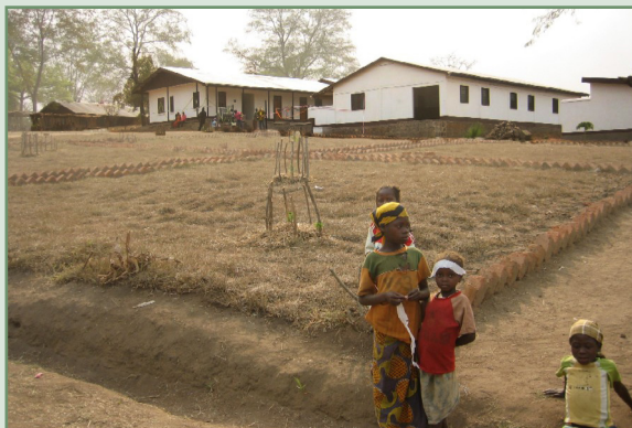
Emmanuel Health Center from the road - January 2010