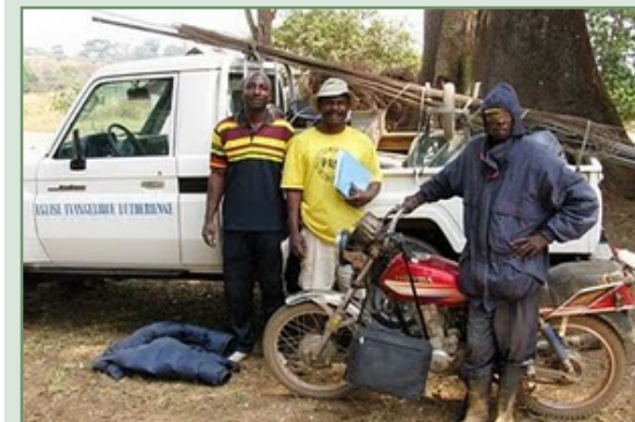
Motorcycles as a mode of transportation in CAR